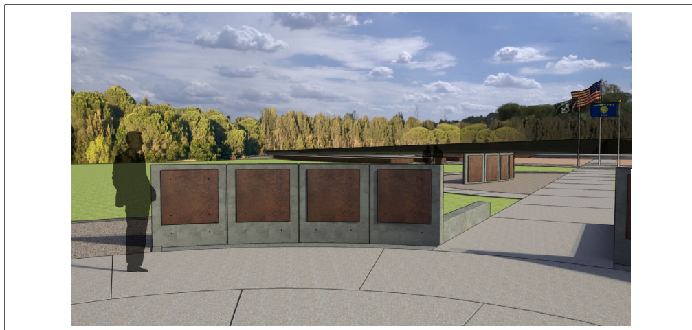
(A drawing depicting the entrance to the Vietnam Wall scheduled for installation at US Cellular Park in Medford, Oregon)

“It is with the conception and full understanding that many things of great need and importance can be accomplished in unity and cooperation. Thus, do the members of the Non-commissioned Officers Association of the United States of America agree to join their efforts and strength to work together for the well-being of the individual, the group, and for the greatest benefit of our beloved nation.”