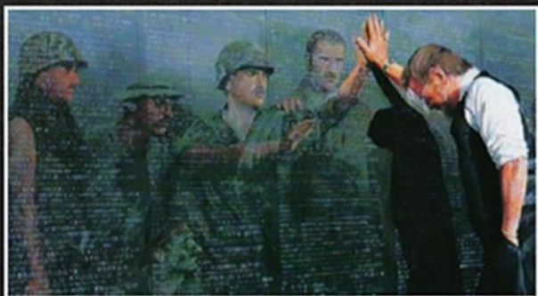
Every name has a face.

This is the final fundraising step to get the wall installed, ready for viewing. The wall is paid for and has been delivered to covered storage in the Rogue Valley. We need additional funds to prepare the ground and install the panels. If every veteran were to donate just $5, we would have what we need to complete this great tribute to our fallen comrades.