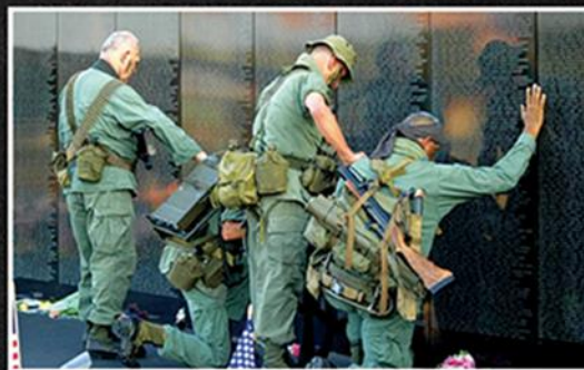
Once a brother, always a brother.