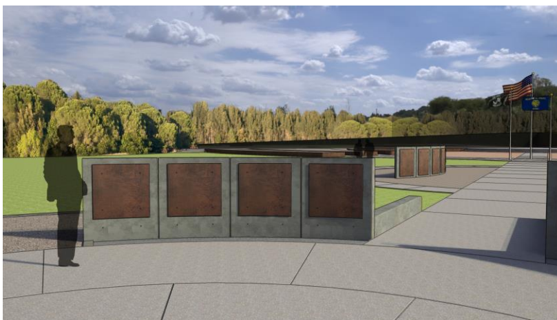
(A drawing depicting the entrance to the Vietnam Wall scheduled for installation at US Cellular Park in Medford, Oregon)

“It is with the conception and full understanding that many things of great need and importance can be accomplished in unity and cooperation. Thus, do the members of the Non-commissioned Officers Association of the United States of America agree to join their efforts and strength to work together for the well-being of the individual, the group, and for the greatest benefit of our beloved nation.”