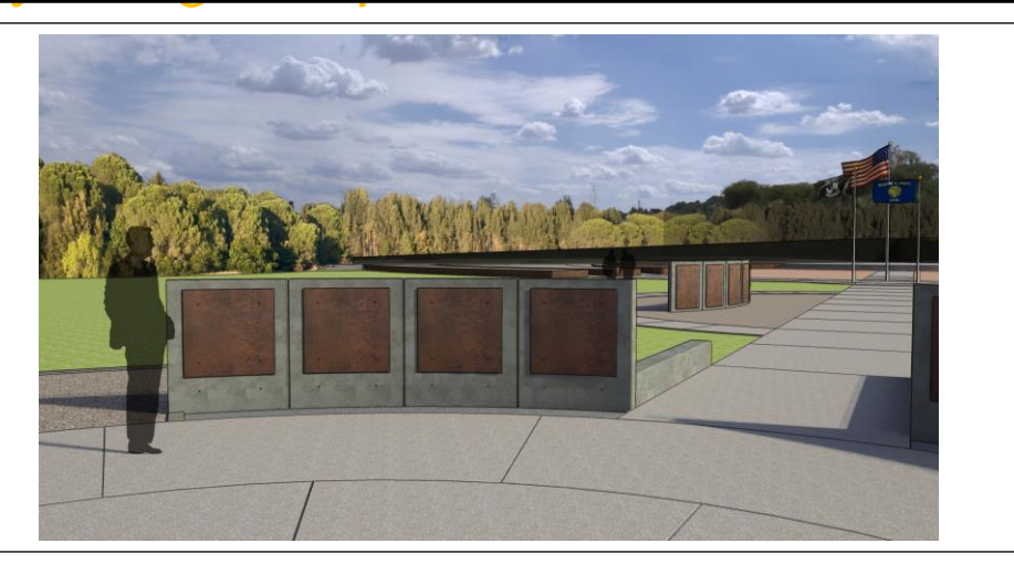
(A drawing depicting the entrance to the Vietnam Wall scheduled for installation at US Cellular Park in Medford, Oregon)

"It is with the conception and full understanding that many things of great need and importance can be accomplished in unity and cooperation. Thus, do the members of the Non-commissioned Officers Association of the United States of America agree to join their efforts and strength to work together for the wellbeing of the individual, the group, and for the greatest benefit of our beloved nation."